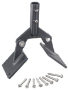
STANDARD SIZE ADJUSTABLE ROOF MOUNT - 401AL 12"L X 7"H X 4"W