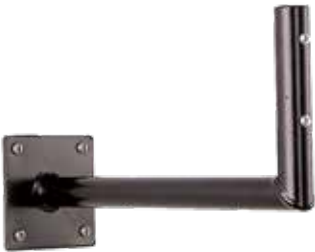
12" STEEL EAVE MOUNT - 585H 12"L X 6"H X 4"W