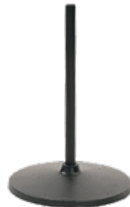
CAST IRON BASE - 582 12"L X 18"H