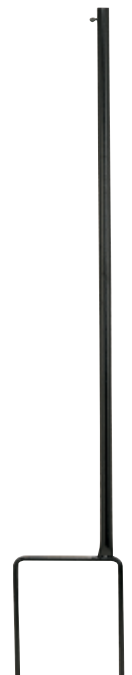
STANDARD SIZE GARDEN POLE - 403R 53"H X 11"L