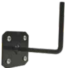
FIGURE ONLY MOUNT RECOMMENDED FOR STORE DISPLAYS 587-2, 587L-2, 587-4, 587L-4