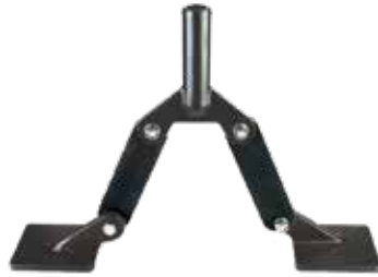
RIDGE VENT ADJUSTABLE ROOF MOUNT - 401ALR ADDS 6" IN HEIGHT TO 401AL