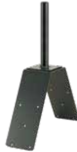
LARGE SIZE STEEL ROOF MOUNT - 401LG 14"L X 19"H X 5"W