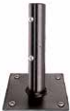
POST BRACKET - 586M 3"L X 5"H