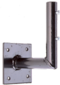
5" STEEL MOUNT - 585S 5"L X 6"H X 4"W