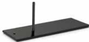
AMERICAN MANTEL BASE - 402 11"L X 4"W X 4"H