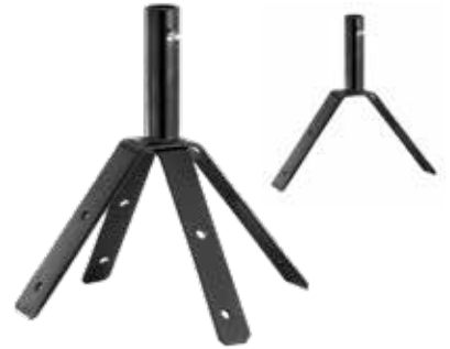
2 OR 4-SIDED ROOF MOUNT - 404 8"L X 10"H X 7.5"W