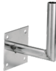
5" STAINLESS STEEL MOUNT - 585ST 5"L X 6"H X 4"W